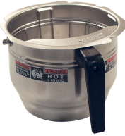
FUNNEL AY,W/DECAL GRT "C"7.62