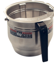
FUNNEL AY,W/DECAL GRT "C"7.12