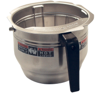
FUNNEL AY,W/DECAL GRT "C"7.62