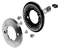
BURR SET KIT, NEW