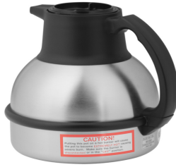
THERMAL CARAFE, BLK 1.83 L 1PK