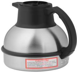
THERMAL CARAFE, BLK 1.9L 12PK