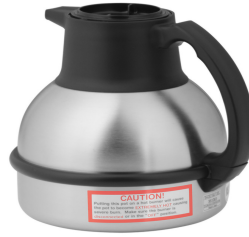
THERMAL CARAFE,ORN 1.9L 12PK