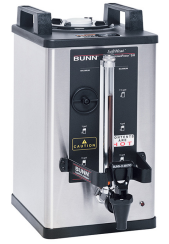
SH SERVER, 1.5G 120 MIN ADJ TMR AUTO OFF