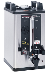
SOFT HEAT SERVER, 1.5G(SH)