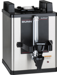
SH-S SERVER 1G 60 MIN ADJ TMR