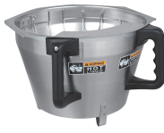
FUNNEL ASSY W/ BASKET, TITAN