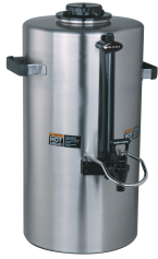
TITAN TF SERVER