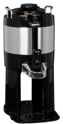
TF SERVER, 1G/3.8L MECH