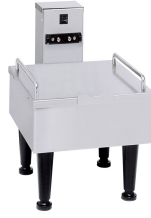
1SH STAND, 120V