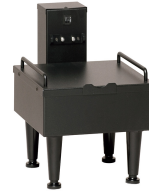
1SH STAND, 120V BLK