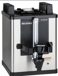
SH-S SERVER 1G 60 MIN ADJ TMR