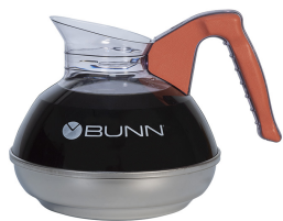
DECANTER, EASY POUR ORANGE-CANADA 1/CS