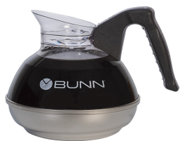
DECANTER, EASY POUR® BLACK-CANADA 1/CS