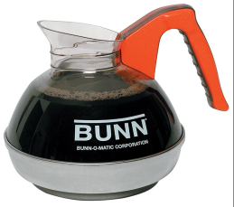
DECANTER, EASY POUR ORANGE-CANADA 1/CS