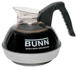
DECANTER, EASY POUR BLACK-CANADA 1/CS